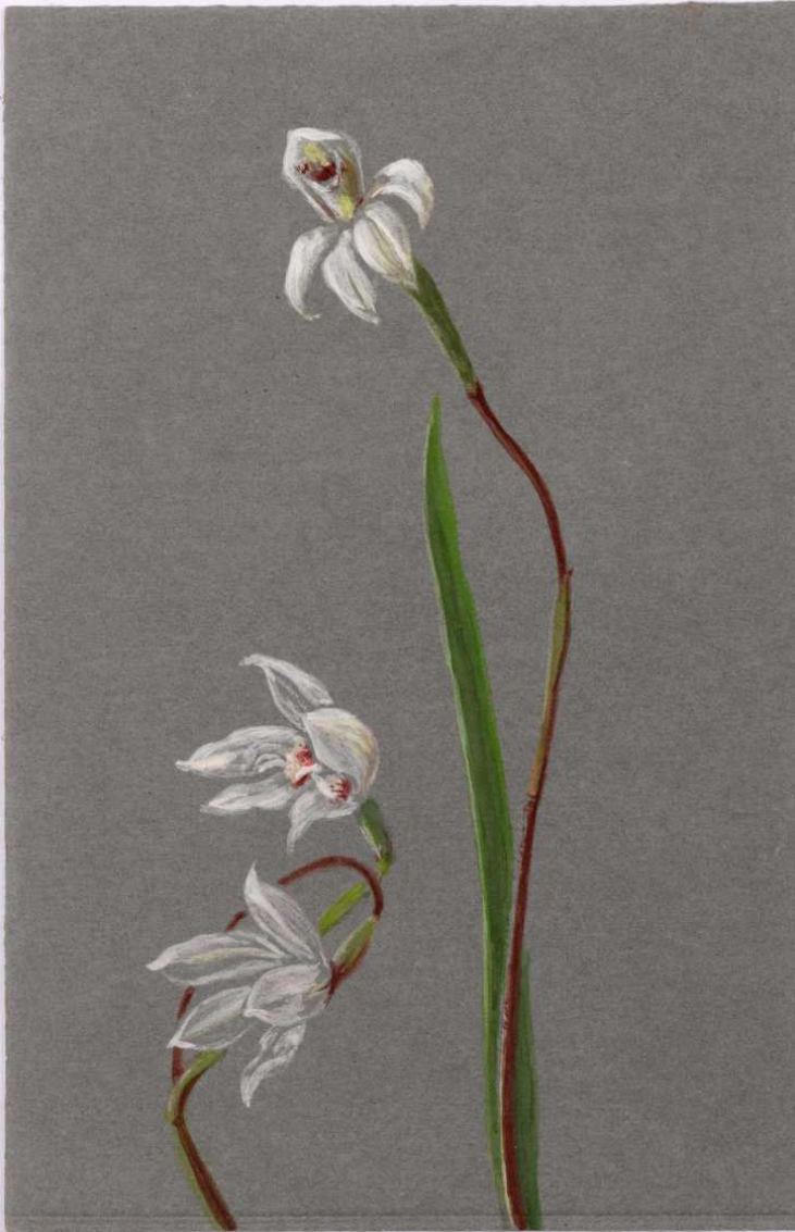
Eleonore Blumhardt. Caladenia lyallii .