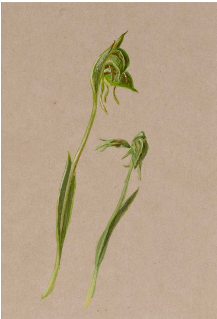
Eleonore Blumhardt. Waireia stenopetala .