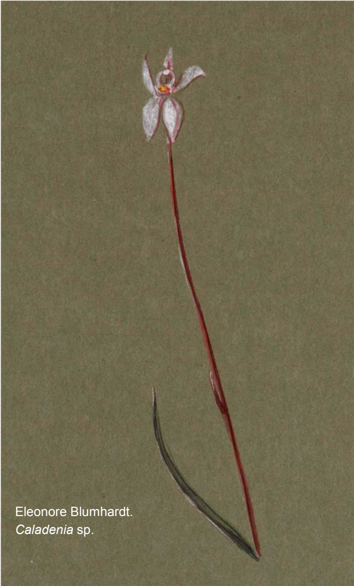
Eleonore Blumhardt. Caladenia sp.