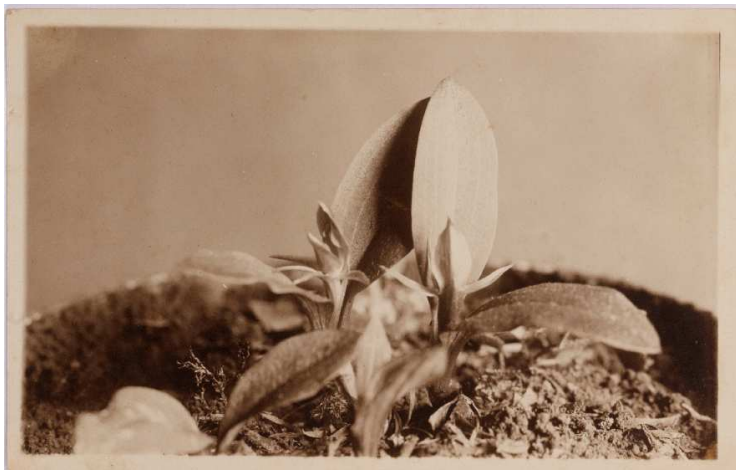
Chiloglottis cornuta.