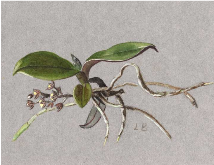
Lydia Blumhardt. Drymoanthus adversus .